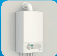
Protects boilers and keeps pipework clear