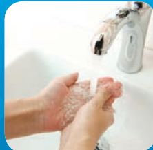
Prevents hard scale forming on taps

Hard waters form scale in pipes and boilers and on visible surfaces such as taps, showers and inside kettles. Clogged pipes may have to be replaced. Heating coils may overheat and fail.