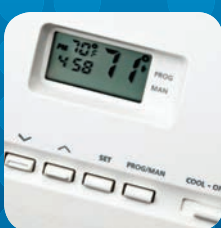
Maintains your boiler's energy efficiency